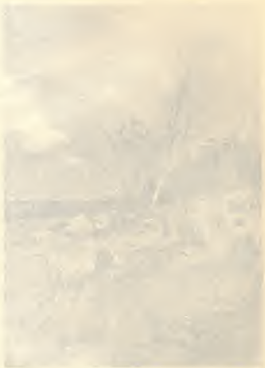
The Old Burying-Ground